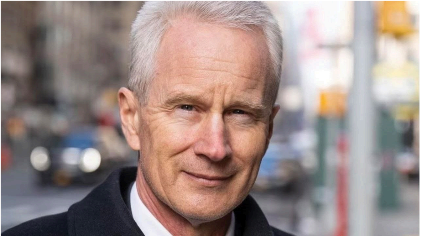
Dr. Peter McCullough