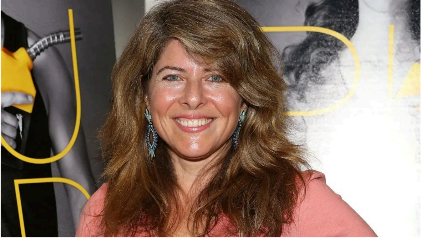
Dr. Naomi Wolf

The CDC says it's all fine; it says miscarriage rates range from 10% to 20% naturally with no connection to the vaccine. ACOG (American College of Obstetricians and Gynecologists) has their backs with a 2021 Human Reproduction study monitoring 149,685 women with the overwhelming 9% rate, risk ratio of 1.07.